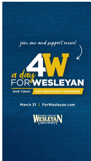
Instagram Story Download