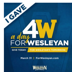
Social Post 2 Download