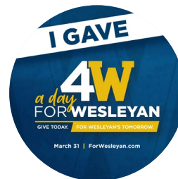
Profile Picture 1 Download