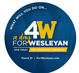
Profile Picture 2 Download