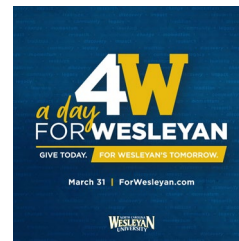
Social Post 1 Download