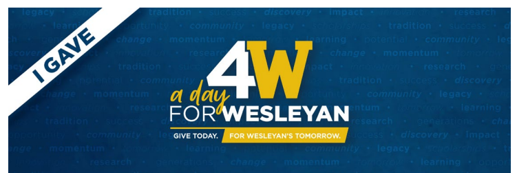
MAKE YOUR GIFT ON OR BEFORE MARCH 31 | ForWesleyan.com Download