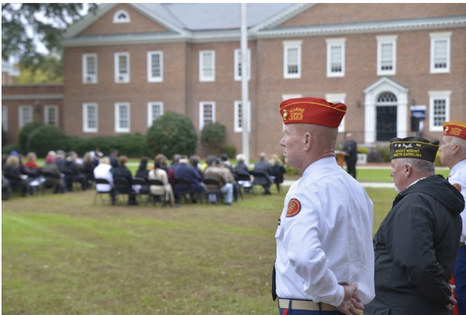
VFW participate in the NC Wesleyan Veterans Day Event November 2018.

I have a question that is not listed here can you answer it? Contact your School Certifying Official, or visit the VA website at https://www.va.gov/education/ . You may also call the toll-free VA Hotline for students at 888-442-4551.